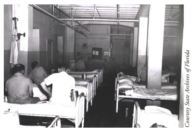
1940s State hospital

Unfortunately, while State hospital beds were shut down by the thousands, the types of comprehensive community-based services and supports promised as a condition of their closing were never developed. Combined with changes in sentencing practices,